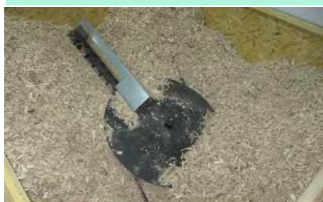
Wood chips storage (room) with the mixer connected to the transporter