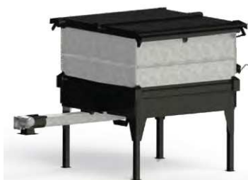
Wood chips storage with the mixer connected to the screw conveyor