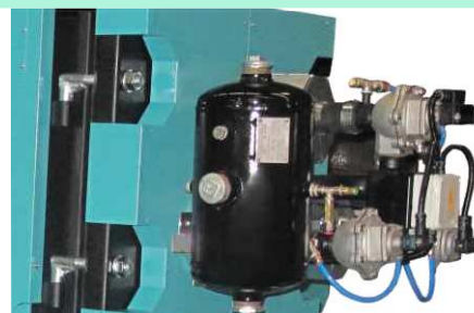
Automatic flue pipes cleaning system